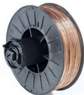
S602116 TG10 + S604